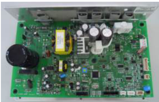
LCB without the transfer board (Part number # 1000203336 )