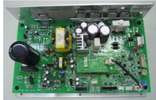
LCB with the transfer board (Part number # 1000336916 )